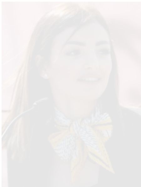
Rosianne Cutajar and Yorgen Fenech